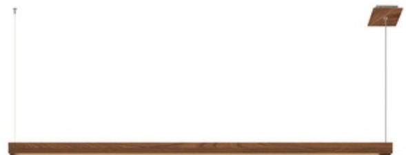
Shown in: Wood Walnut / No Louver

Glide Wood Warm Dim Downlight Suspension with End Feed Power is a linear LED fixture that offers direct light in a clean, contemporary style. Available with one or two canopies. Genuine hand-finished hardwood available in Walnut, Cherry, Maple, White Oak or Espresso featuring a diffused white lens with 100 degree beam spread, a variety of finishes, and optional black or white louvers. Available in Warm Dim 27D (2700K to 2000K) and 30D (3000K to 2000K) color temperatures with 5 LED watts per foot. Channel lengths sold in 12 inch increments from 36 to 120 inches. Canopy size dependent on fixture length. 4 inch canopy available in Satin Nickel for Maple, Walnut, Cherry, and White Oak. Wood Espresso is paired with a Black canopy. Refer to canopy chart for corresponding lengths and canopy finishes. Supplied with 12 feet of adjustable coaxial cables (fixtures exceeding 72 inch include additional aircraft cables). 120 volt input, 24VDC Class 2 output, electronic low voltage LED power supply included in canopy. Dimmable with an electronic low voltage dimmer, sold separately. ETL listed. 5 year warranty. Product is built to order.