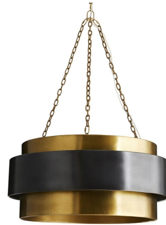
Shown in antique brass