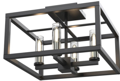
Shown in graphite / graphite

The Sambre Ceiling Light offers an open frame look that would enhance any space. Features Graphite, Brass, or Buffed Nickel finish with Clear glass lamp shades. Includes multiple candle sleeves in Chrome, Satin Brass, Graphite and Buffed Nickel.