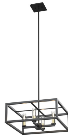
Shown in graphite / graphite

PRODUCT DIMENSIONS . . . . Downrods: (1) 15 inch, (1) 12 inch, (1) 9 inch, (1) 4 inch