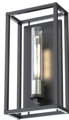
Shown in graphite / clear

The Sambre Wall Light offers an open frame look that would enhance any space. Features Graphite, Brass, Buffed Nickel, or Stainless Steele finish with Clear glass lamp shades. Includes multiple candle sleeves in Chrome, Satin Brass, Graphite and Buffed Nickel.