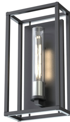
Shown in graphite / clear

The Sambre Wall Light offers an open frame look that would enhance any space. Features Graphite, Brass, Buffed Nickel, or Stainless Steele finish with Clear glass lamp shades. Includes multiple candle sleeves in Chrome, Satin Brass, Graphite and Buffed Nickel.