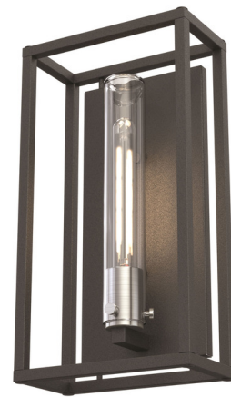
Shown in stainless steel / clear

COLOR . . . . . Clear BODY FINISH . . . . . Stainless Steel WATTAGE . . . . . 100W DIMMER . . . . . Standard 120V DIMENSIONS . . . . . 7.87"W x 14.57"H x 3.94"D BULB NOT INCLUDED . . . . . 1 x T10/Medium (E26)/100W/120V Incandescent OTHER BULB OPTIONS . . . . . 1 x Edison Tube/Medium (E26)/120V Incandescent 1 x Edison Tube/Medium (E26)/120V LED 1 x T10/Medium (E26)/120V LED