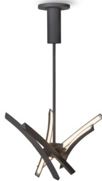
Shown in: Graphite

The Kattari Outdoor Pendant simultaneously offers up / down plus side illumination with a single additional circular center downlight to illuminate directly below the point of installation. Multiple lit curves intersect and unite to create the unique form. Powder coated die cast aluminum ensures it is durable enough for outdoors but will also enhance an inside space. Available in Graphite or White finish. ELT listed. Suitable for wet locations.