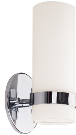
Shown in chrome / white opal

LAMP LIFE . . . . . 50000 hours COLOR RENDERING . . . . . 90 CRI LAMP COLOR . . . . . 3000K LUMENS/WATT . . . . . 46.38 LUMINOUS FLUX . . . . . 371 lumens