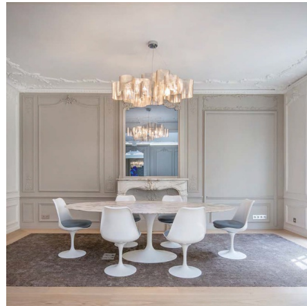
Shown in stainless steel

The Cloud Pendant uses fluid transparency to capture the light, releasing it back into rhythmic compositions from simple geometric forms. Available with a perforated Stainless Steel finish. Handmade in Paris.