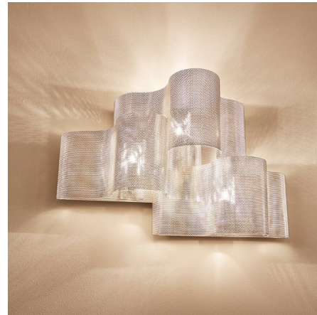
Shown in stainless steel

Cloud Wall Light uses fluid and evanescent transparency to capture the light, releasing it back into rhythmic compositions, from simple geometric forms. Available with a perforated Stainless Steel finish. Handmade in Paris. UL listed.