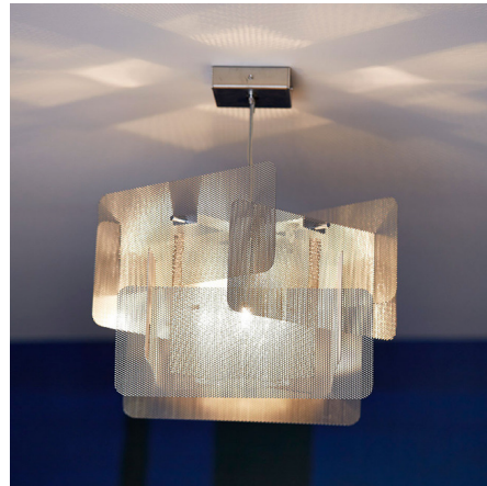
Shown in stainless steel

Cube Pendant uses fluid and evanescent transparency to capture the light, releasing it back into rhythmic compositions, from simple geometric forms. Available with a perforated Stainless Steel finish. Handmade in Paris.