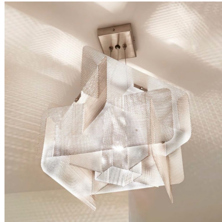
Shown in stainless steel

Cube Pendant uses fluid and evanescent transparency to capture the light, releasing it back into rhythmic compositions, from simple geometric forms. Available with a perforated Stainless Steel finish. Handmade in Paris.