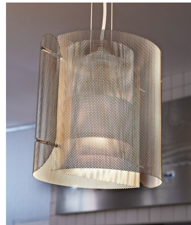
Shown in stainless steel

Ellipse Pendant uses fluid and evanescent transparency to capture the light, releasing it back into rhythmic compositions, from simple geometric forms. Available with a perforated Stainless Steel shade and finish. Includes 5 feet of adjustable cord to customize length. Handmade in Paris. UL listed.