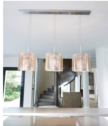
Shown in stainless steel

Ellipse Trilogy Pendant uses fluid and evanescent transparency to capture the light, releasing it back into rhythmic compositions, from simple geometric forms. Available with perforated Stainless Steel shades and finish. Includes three 5 feet of adjustable cords to customize length. Handmade in Paris. UL listed.