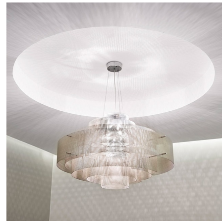
Shown in stainless steel

Galaxy Pendant uses fluid and evanescent transparency to capture the light, releasing it back into rhythmic compositions, from simple geometric forms. Available with a perforated Stainless Steel finish in small, medium, and large sizes. Includes 5 feet of adjustable cord to customize length. Handmade in Paris. UL listed.