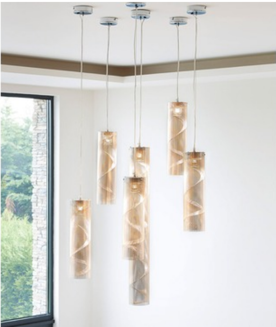
Shown in: Stainless Steel

DESCRIPTION Spiral Pendant uses fluid and evanescent transparency to capture the light, releasing it back into rhythmic compositions, from simple geometric forms. Available with a perforated Stainless Steel in small and large sizes. Includes 5 feet of adjustable cord to customize length. Handmade in Paris. UL listed.