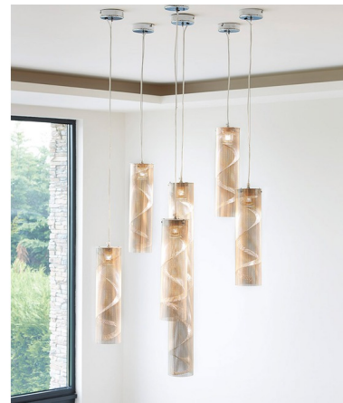
Shown in stainless steel

Spiral Pendant uses fluid and evanescent transparency to capture the light, releasing it back into rhythmic compositions, from simple geometric forms. Available with a perforated Stainless Steel in small and large sizes. Includes 5 feet of adjustable cord to customize length. Handmade in Paris. UL listed.