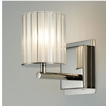
Shown in polished nickel / frosted

The Flute Wall Light features a cylindrical ribbed Frosted glass shade set against a square backplate for a sleek, sophisticated look. Available in two sizes with a Polished Chrome, Polished Nickel, Polished Gold, or Brushed Nickel. Polished Nickel shown with US backplate. All finishes ship with extended US backplate. NOTE: Larger size is NOT available with a Brushed Nickel finish.