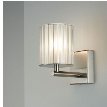
Shown in brushed nickel / frosted

The Flute Wall Light features a cylindrical ribbed Frosted glass shade set against a square backplate for a sleek, sophisticated look. Available in two sizes with a Polished Chrome, Polished Nickel, Polished Gold, or Brushed Nickel. Polished Nickel shown with US backplate. All finishes ship with extended US backplate. NOTE: Larger size is NOT available with a Brushed Nickel finish.