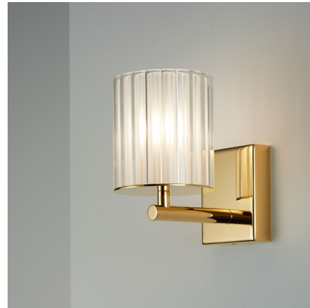
Shown in polished gold / frosted

The Flute Wall Light features a cylindrical ribbed Frosted glass shade set against a square backplate for a sleek, sophisticated look. Available in two sizes with a Polished Chrome, Polished Nickel, Polished Gold, or Brushed Nickel. Polished Nickel shown with US backplate. All finishes ship with extended US backplate. NOTE: Larger size is NOT available with a Brushed Nickel finish.