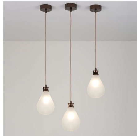
Shown in satin bronze / frosted

The Cintola Pendant features a single hand blown teardrop shaped glass diffuser set into an anodised aluminum body. Beautiful hung as a solo fixture or hang in combination to suit your design needs. UL and CUL listed.