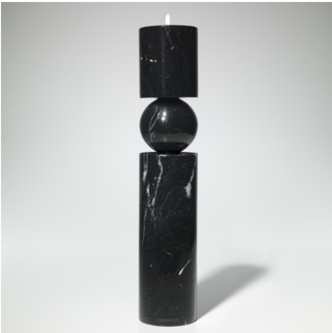
Shown in: Black Marble

The Fulcrum Candlesticks offer a sculptural form playing on the concept of pivots and supports, these geometric votives offers a unique touch for any space with its cylindrical forms that appear to balance on a central sphere.