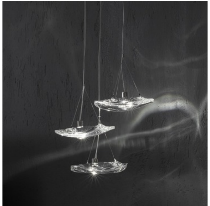
Shown in: White / Clear

Manta Cluster Pendant, designed by Dodo Arslan and Nicolas Terzani, features sinuous, undulating lines, resulting in soft waves of Crystal light reminiscent of being underwater. This organic piece is perfect in any room. Has three crystal pieces to place at your desired length. Comes with 6 feet of cable to customize length. 2700K and 3000K light color temperature options available. ETL listed.