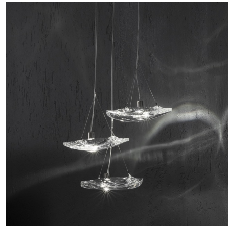
Shown in white / clear

LAMP COLOR . . . . . 3000K LUMENS/WATT . . . . . 213.33 LUMINOUS FLUX . . . . . 320 lumens