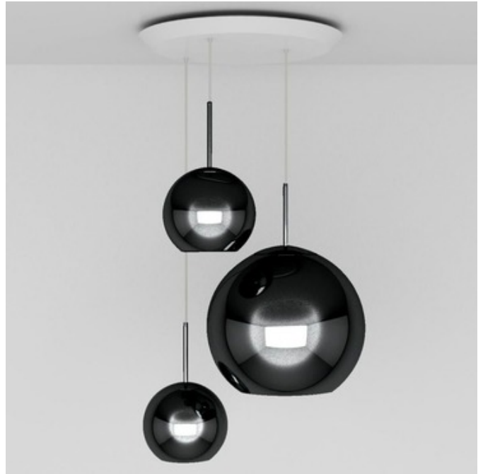
Shown in: Black Copper

The Copper Trip Round Pendant system, designed by Tom Dixon, offers a bold statement featuring a cluster of three round pendants of varying size that will add a modern, sculptural element to any space. Available finished in Copper, Black Copper. Includes 98.4 inches of clear adjustable cable. UL and CUL listed.