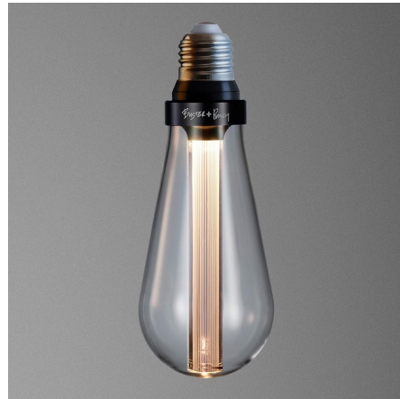
Shown in crystal

LAMP LIFE . . . . . 30000 hours COLOR RENDERING . . . . . 80 CRI LAMP COLOR . . . . . 2700K LUMENS/WATT . . . . . 64.00 LUMINOUS FLUX . . . . . 320 lumens