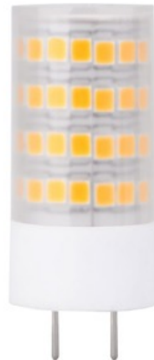
Shown in: White

The JCD G8 Bi-Pin Base 5 Watt 120 Volt 2700K LED retrofit lamp is an energy efficient alternative to incandescent G8 base lamps. Equivalent to 60 watt halogen. Fully dimmable with most LED and incandescent dimmers. ETL listed for damp locations. Suitable for enclosed fixtures. Sold individually.