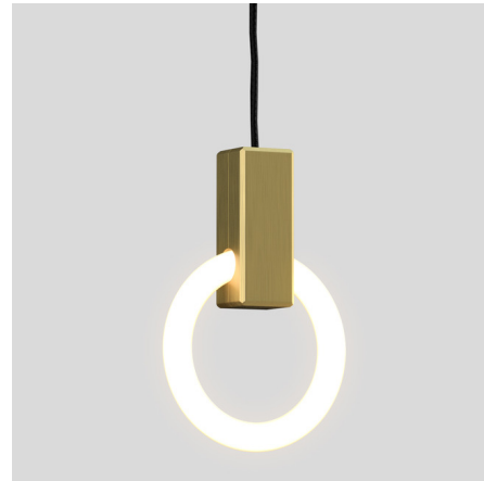
Shown in silk black canopy / brushed brass

The Halo Pendant was originally conceived as a graphical interpretation of effervescence. It is a sophisticated, hanging art piece both illuminated and at rest.