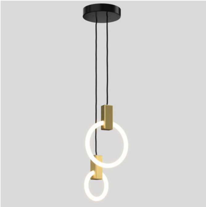
Shown in: Silk Black Canopy / Brushed Brass

The Halo Round Multi Light Pendant was originally conceived as a graphical interpretation of effervescence. Available with two, three, five, seven, nine, or eleven lights with a mix of different diameter dimmable proprietary LED bulbs. Includes ELV driver. Phase dimming.