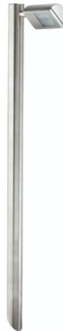
Shown in: Stainless Steel

The Pure LED Border Lite Single Path Light features a single head which can be aimed in different directions, making it ideal for path lighting. Head has a fully adjustable arm allowing 360 degree rotation and 0 to 90 degree elevation. Available in 316 Stainless Steel or powder coat Black or Bronze finish with frosted shatter resistant glass lens. Includes Cree XPG-3 LED module and 12 volt integral Hunza Buckbullet driver (D3=1W/350mA, D7=3W/700mA). Available in three color temperature options. IP56/IP66 rated for wet locations. Required transformer and optional accessories sold separately. Dimmer type dependent on type of transformer/power supply selected (low voltage electronic or low voltage magnetic).