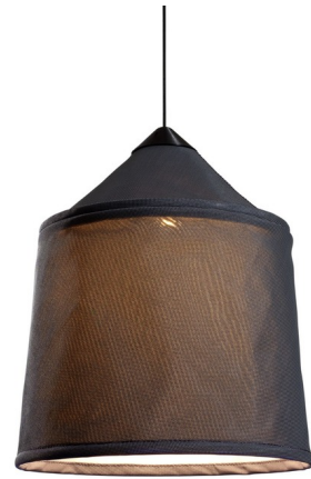
Shown in black / grey

COLOR RENDERING . . . . . 90 CRI LAMP COLOR . . . . . 2700K LUMENS/WATT . . . . . 72.80 LUMINOUS FLUX . . . . . 1092 lumens