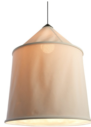
Shown in black / beige

Jaima Pendant, designed by Joan Gaspar, is inspired by the fabrics of the Bedouin tents of North Africa. The flexible ductile material, textielene, sifts light through the white inner shade as it moves. Available in Green, Blue, Beige, and Grey with a Black finish in small, medium, and large sizes. Includes a hook accessory to hang the facilitate hanging the pendant on guide wires. Comes with 78.74 inches of cable to customize length.