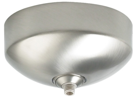
Shown in satin nickel

The Freejack Surface Canopy mounts to a standard 4 inch junction box with round plaster ring (provided by electrician). Includes an electronic transformer and features one Freejack port. For ceiling or wall. If mounting to wall, head should be no longer than 6 inches. Dimmable with an electronic low voltage dimmer, sold separately. Compatible with both halogen and LED Freejack pendants and heads up to 60 watts.