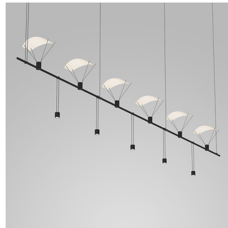
Shown in satin black

Luminaire 1: 6 x Duplex 50 Deg Cylinder/ Parachutes Luminaire 2: 5 x Suspended 50 Deg Cylinders Transformer Location: Mini Box