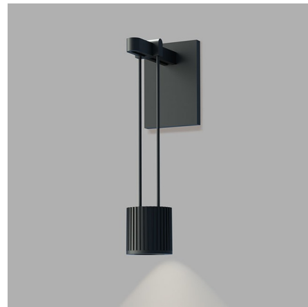
Shown in satin black

Bar-Mounted Cylinders attach to the single sconce power feed, forming a range of functional architectural Suspenders Sconces. Includes (1) Precise Suspended Cylinder luminaire with choice of (1) 50 Degree Snoot Cylinder or Clear Lens cylinder. Note: Fixture includes a 60 watt 24 volt transformer which fits inside mini box enclosure.