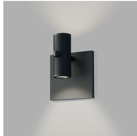
Shown in satin black

Bar-Mounted Cylinders attach to the Single Sconce Power Feed, forming a range of functional architectural Suspenders Sconces. Available with a Satin Black finish. ADA Compliant. ETL and UL listed. Luminaire 1: 1 x Duplex 50 Deg Cylinder or Duplex Diffused Cylinder Transformer Location: Outlet Box