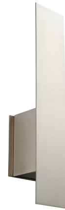
Shown in satin nickel / satin nickel

Minimal and sleek, the Reflex Wall Sconce adds a modern aesthetic to a range of spaces, from hallways and offices to living rooms and bedrooms. LED light passes through perforated metal diffusers to illuminate your space. An optional 4.75 x 6 inch cover plate is included for mounting to a 4 inch octagonal junction box.