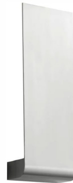
Shown in satin nickel / matte white acrylic

The Halo Wall Sconce features a sleek and elegant profile. A metal arm extends upward, providing soft, indirect light. For a minimal install, the sconce can be installed without the backplate. For a standard junction box, use the supplied cover plate. Note: 18 inch no longer available in Polished Chrome.