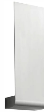
Shown in satin nickel / matte white acrylic

The Halo Wall Sconce features a sleek and elegant profile. A metal arm extends upward, providing soft, indirect light. For a minimal install, the sconce can be installed without the backplate. For a standard junction box, use the supplied cover plate. Note: 18 inch no longer available in Polished Chrome.