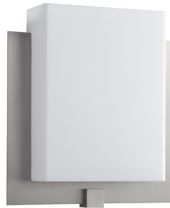
Shown in satin nickel / matte white