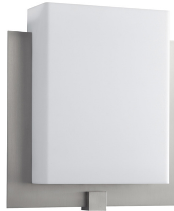
Shown in satin nickel / matte white