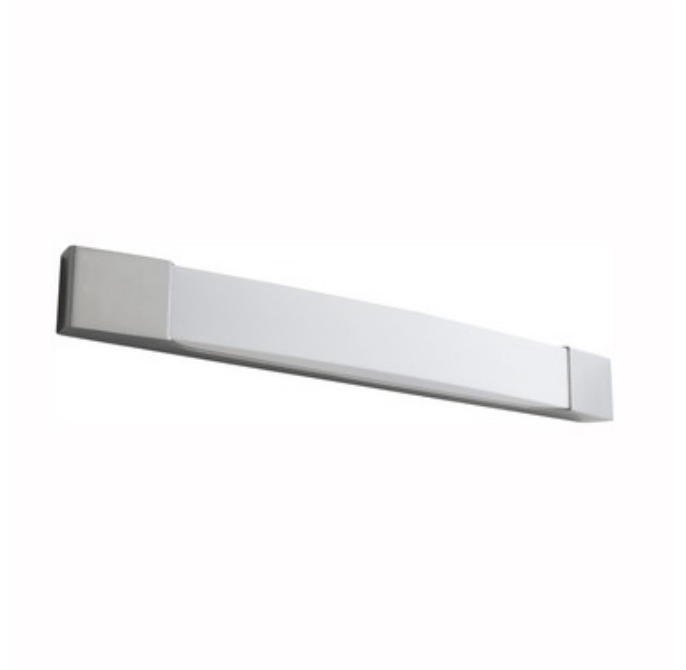
Shown in: Satin Nickel / Matte White Acrylic

The Apollo LED Bathroom Vanity Light features a steel housing with a 1/8 inch thick acrylic shade. Approved for vertical or horizontal mounting. Toolless access to lamps. Dimmable with a low voltage electronic or 0-10V dimmer, sold separately. Mounts to 2 x 3 inch junction box.