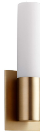
Shown in aged brass / white opal glass