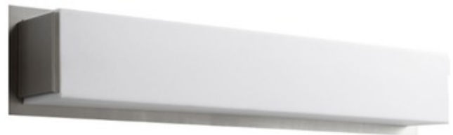
Shown in: Satin Nickel / Matte White Acrylic

The Fuse Bathroom Vanity Light features a steel housing with a 1/8 inch thick acrylic shade. Approved for vertical or horizontal mounting. Toolless access to lamps. Unit mounts to 4 inch octagon junction box, with additional holes provided to mount direct to structure. Dimmable with a low voltage electronic or 0-10V dimmer, sold separately.