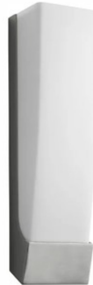
Shown in: Satin Nickel / Matte White Acrylic

The Apollo Wall Light features a steel housing with a 1/8 inch thick acrylic shade. Perforated metal top lens. Toolless entry for fluorescent option only. Compact Fluorescent: UL listed. Electronic, HPF, Programmed Start, Universal Voltage (120-277V) ballast. LED: ETL listed. Dimmable with a low voltage electronic or 0-10V dimmer, sold separately. Mounts to a 4 inch octagonal junction box.