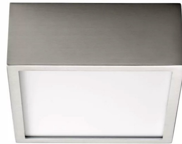
Shown in satin nickel / matte white acrylic