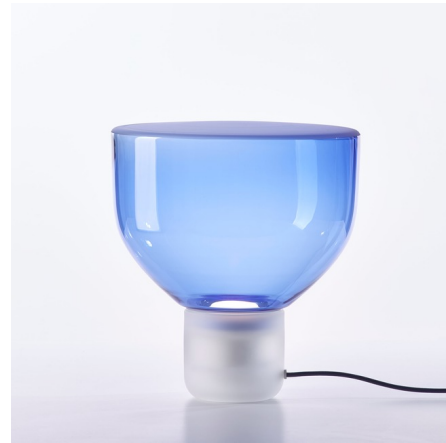
Shown in transparent / transparent blue

The Lightline Table Lamp is a celebration of glass as an artistic medium. The design projects light upward to be uniformly dispersed through the sandblasted top. The impressive shade is treated with a nano coating to prevent the accumulation of dust and smudges. Available in three sizes in a variety of transparent glass colors. Choice of Glossy transparent glass or Acid Etched matte glass base.