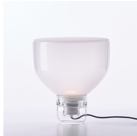
Shown in transparent / transparent opaline

The Lightline Table Lamp is a celebration of glass as an artistic medium. The design projects light upward to be uniformly dispersed through the sandblasted top. The impressive shade is treated with a nano coating to prevent the accumulation of dust and smudges. Available in three sizes in a variety of transparent glass colors. Choice of Glossy transparent glass or Acid Etched matte glass base.