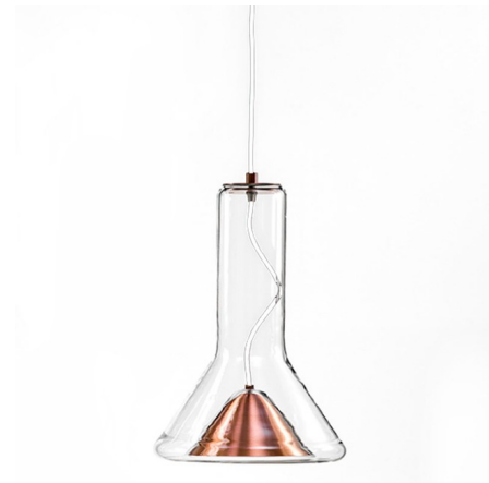
Shown in copper / white cord / clear

The Whistle Pendant is inspired by the blowpipe, known as a glass-maker's whistle. The shape and the cable winding its way up through the body of the light define the character of its simple form. Fitted with a special integrated connector developed by Brokis to facilitate installation and cleaning. Available with a variety of glass and finish options. NOTE: Cord Length must be specified upon ordering and is not field-adjustable. Please contact our sales team.