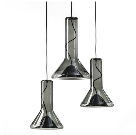
Shown in black / black cord / transparent

BEAM ANGLE . . . . . 100° LAMP COLOR . . . . . 2700K LUMENS/WATT . . . . . 70.00 LUMINOUS FLUX . . . . . 700 lumens