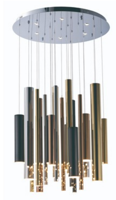
Shown in: Polished Chrome

The Flute Multicolor Linear Pendant doubles as a piece of art. Features elongated metal tubes in different lengths and diameters that are finished in Rose Gold, Black Chrome, Polished Brass and Polished Chrome. Each tube encases a replaceable LED module. Additional LED modules in the ceiling canopy highlight the high gloss finish of the metal tubes and provide additional down light. Available in a rectangular or round configuration. Dimmable to set the mood. ETL listed.