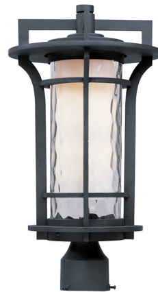
Shown in black oxide / water glass

LAMP LIFE . . . . . 25000 hours COLOR RENDERING . . . . . 90 CRI LAMP COLOR . . . . . 3000K LUMENS/WATT . . . . . 88.89 LUMINOUS FLUX . . . . . 800 lumens