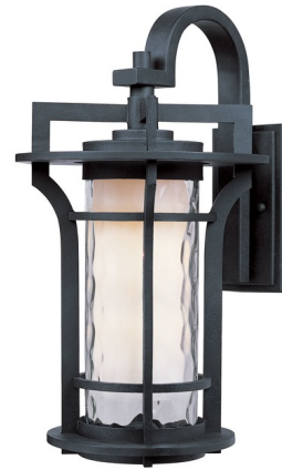
Shown in black oxide / water glass

Oakville LED E26 Outdoor Hanging Wall Light is a unique contemporary piece, perfect in any exterior space. Water glass surrounds an opal diffuser and is complimented by die cast aluminum finished in Black Oxide. Available in small, medium, and large sizes. Wet location rated. Title 24 compliant. UL listed.