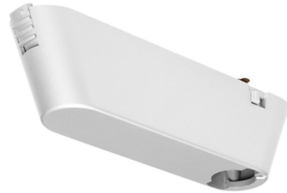
Shown in silver

T537 G2 features a low profile, contemporary housing design made of high impact polycarbonate with an integral on/off switch. Constructed using high quality, LED-compatible LTF Model TA60WA 12V AC transformer. Designed to accept Juno Trac-Master 12V AC halogen or LED lampholders with a non-Quick Jack interface. May be used with Juno Trac-Master or Trac-Lites Series track or designated monopoints. Compatible with most 12VAC LED lamps (contact manufacturer to confirm compatibility). May also be used with incandescent (halogen) lamps.